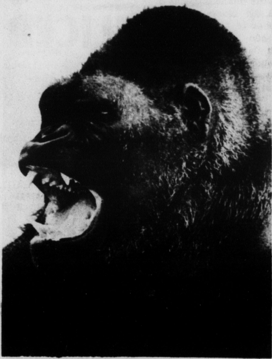
ROOARRRR!! - No, this isn't one of the commissioner candidates, but Kongo, the largest gorilla in captivity and one of the featured attractions of Hoxie's Great American Circus in Kings Mountain Wednesday for two shows.

hours, then moves on to the next show date.