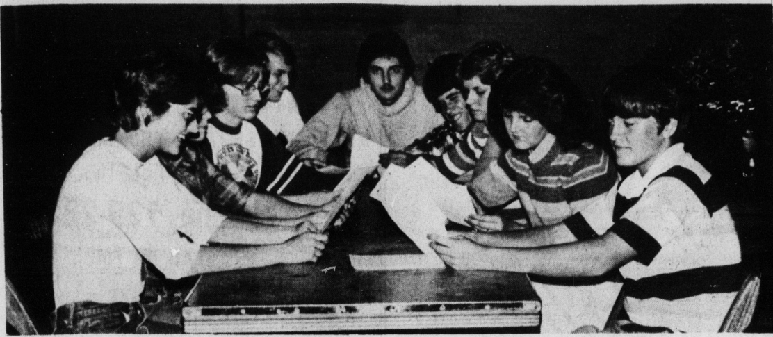
CHURCH YOUTH PROJECT — Members of the Senior High Fellowship of Boyce Memorial ARP Church look over plans for two big projects underway this month for church benefit. From left around the