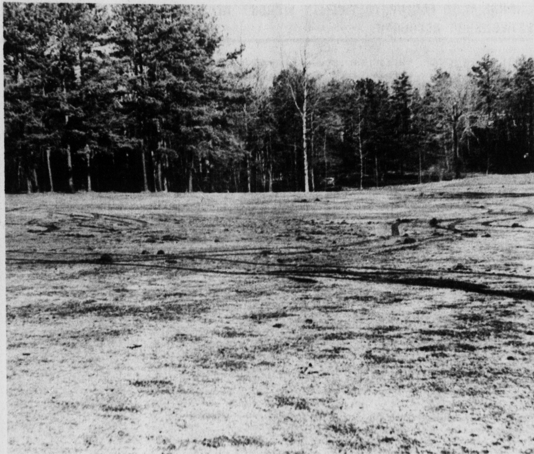
Damaged fairway at KMCC....