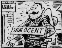
Frank James, outlaw and brother of Jesse James, was acquitted when finally brought to trial.