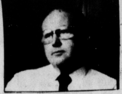
From Wilson Griffin

In America today, there are more than 4,000,000 home accidents each year — 30,000 are fatal; 225,000 accidents involve washing machines, stoves, power mowers and heating devices; 30,000 accidents involve extension cords. The message is plain — great caution must be used in using heating and electrical equipment and machinery with moving parts. Parents should stop and analyze the dangers involved in each household appliance and then carefully explain the risks to children and instruct them in safe operation.