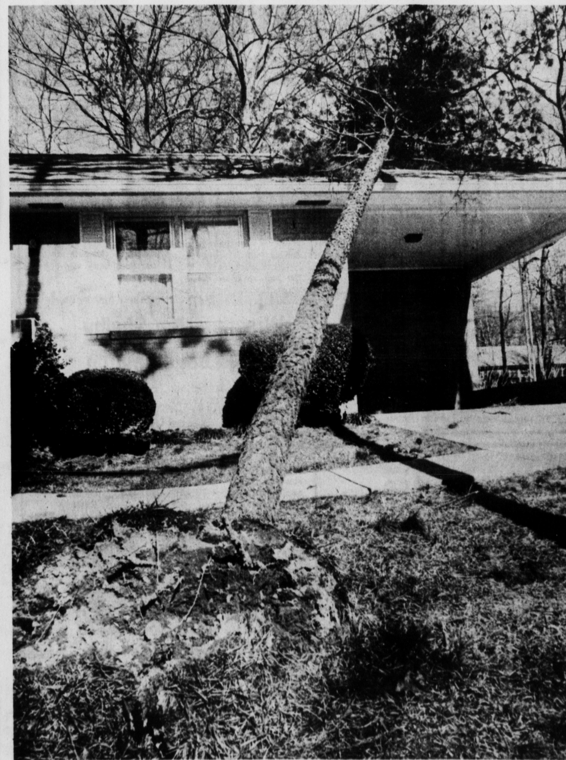
Pine tree resting gently on Edwards' carport....