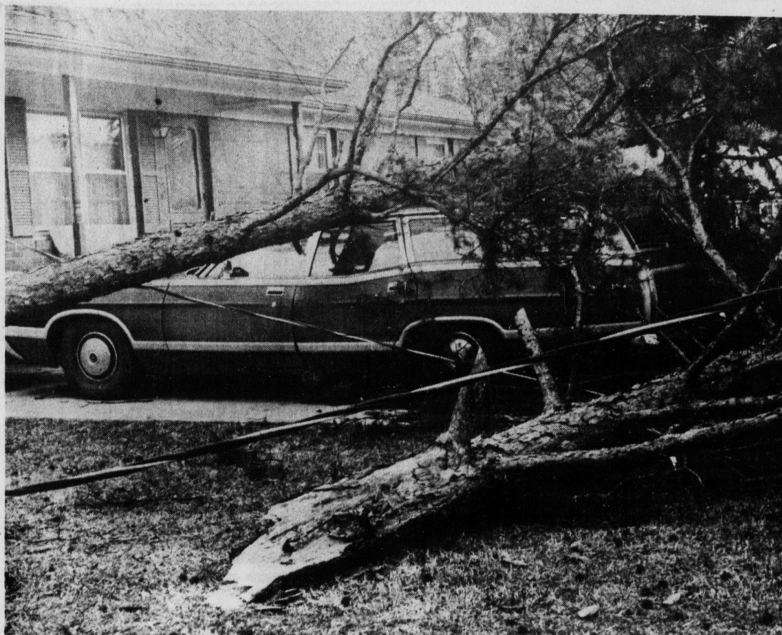
Trees crunch Wiggins' wagon.....

Friday, even with power restored, there were areas in the city receiving reduced electrical flow while city crews continued to make minor repairs to the system.