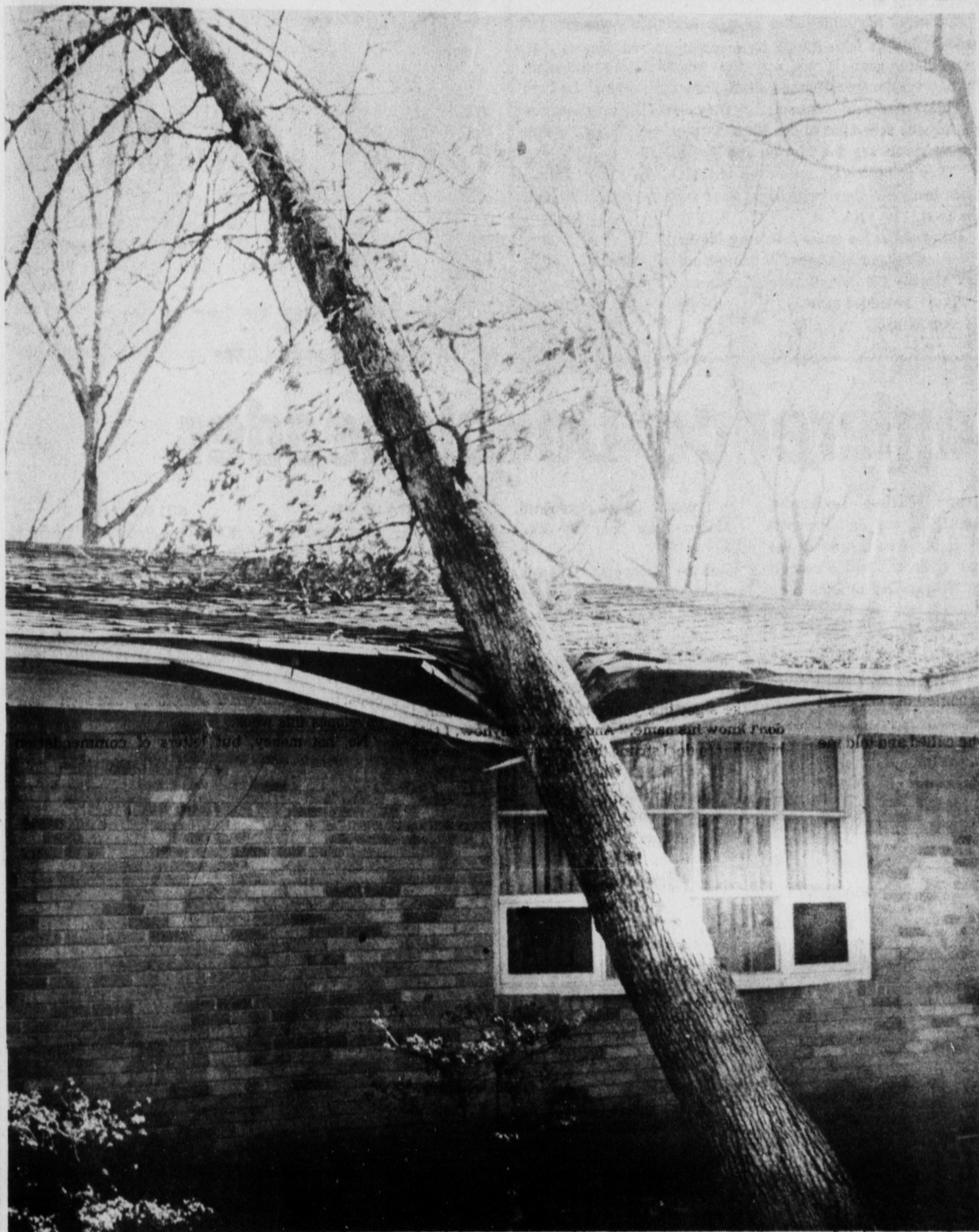
Vernon Smith's home damaged by fallen pine tree....