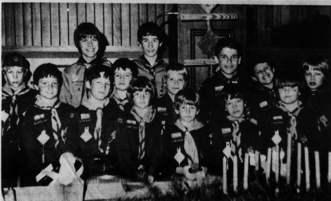
RACE IN PINWOOD DERBY — The Cub Scouts and Webelos, pictured, took part in the annual Pinewood Derby sponsored by Pack 98 of Boyce Memorial ARP Church last Tuesday night. A blue and gold banquet was held prior to the race in the church fellowship hall.