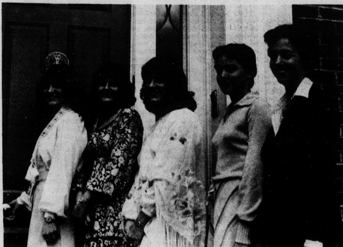
KINGS MOUNTAIN DEBUTANTES — The five Kings Mountain young ladies, above, were among those honored at an Orientation Tea Thursday which opened