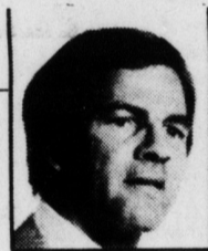
FRANK GIFFORD SUGGESTS: