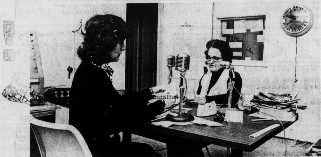
RADIO PROGRAM - Blind reading program may be expanded - a Blind reading program on WGFG-FM radio, 88.3 on the FM dial, may be expanded. The program is now on from 11 a. m. to noon, Monday through Friday. A survey to the blind is being sent out to determine

Take stock in America. Buy U.S. Savings Bonds.