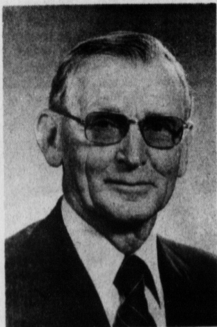
Experienced and Qualified in all phases of Law Enforcement

I solicit your support and vote on May 2