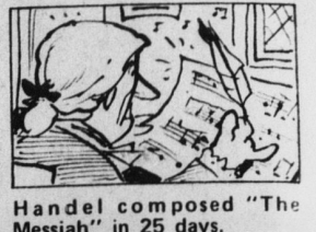
Handel composed "The Messiah" in 25 days.

Because credit unions are made up of either your colleagues at work or members of your union or civic group, they know you personally, point out credit experts at the National Association of Federal Credit Unions. That makes credit easier and more pleasant to get.