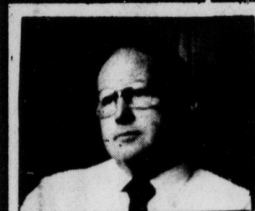
From Wilson Griffin

While considered one of the safest drugs, aspirin sometimes causes gastro-intestinal bleeding. Studies indicate the bleeding results from a local effect produced by aspirin particles.