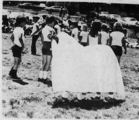
THE OLD GRAY MARE - First Graders at Grover School, pictured, perform a dance to "The Old Gray Mare," during May Day festivities on the school campus.