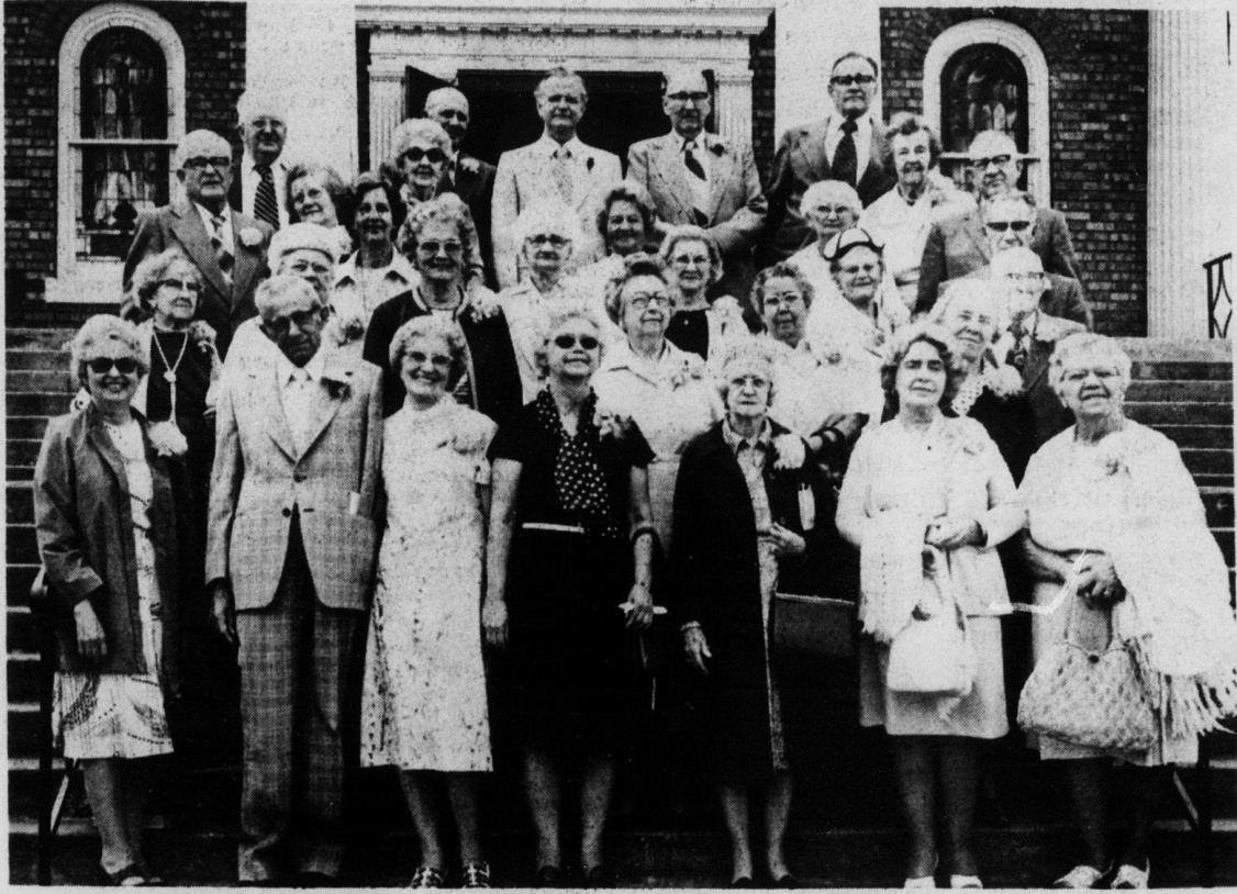
SENIOR CITIZENS HONORED — Senior Citizens of Kings Mountain Baptist Church were honored during a special program May 7th. They are pictured on the steps of the church.