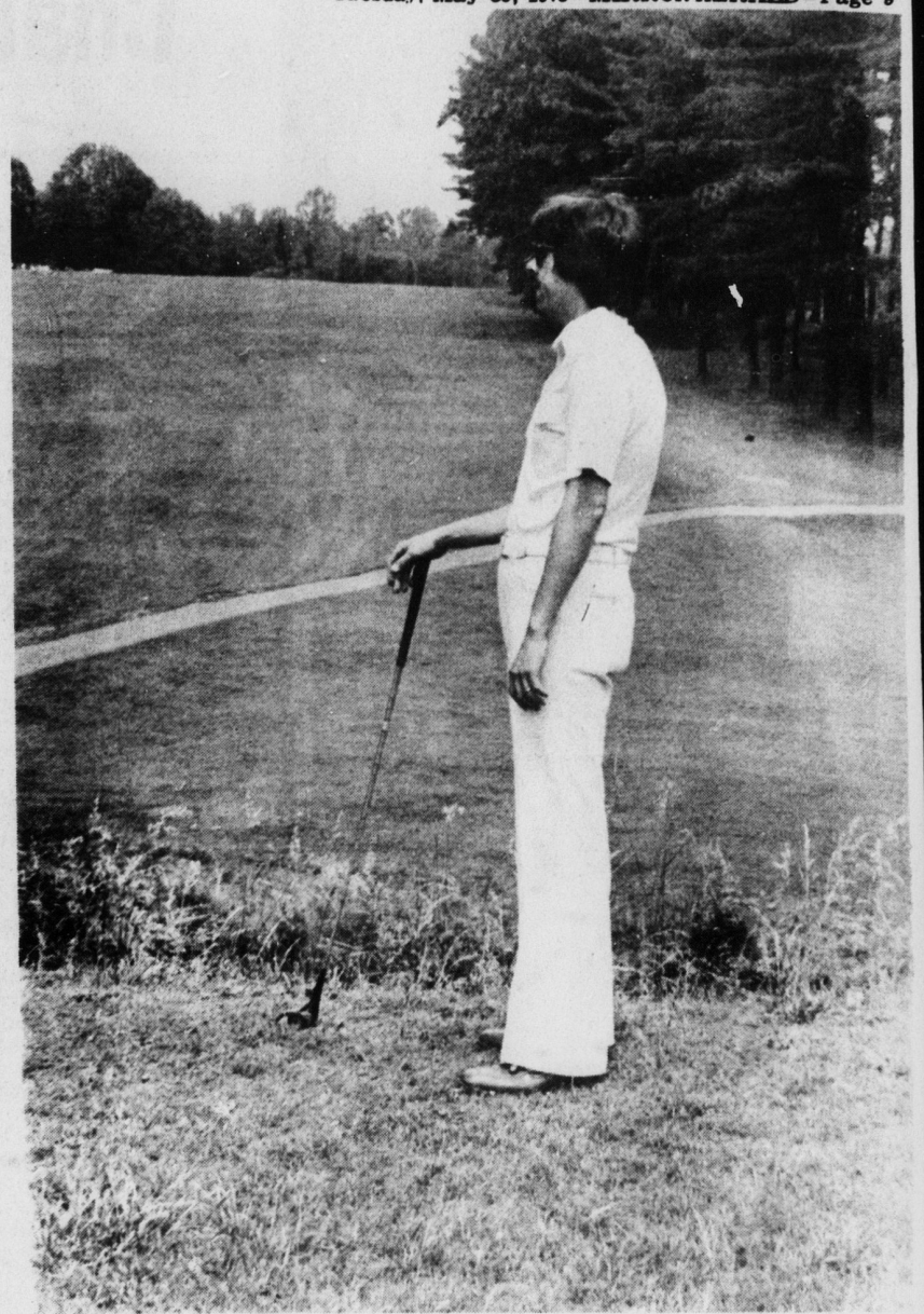
...And looking over the golf course