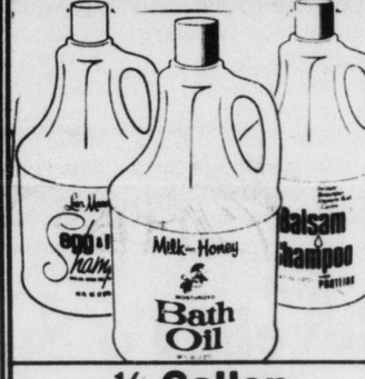
1/2 Gallon Toiletries