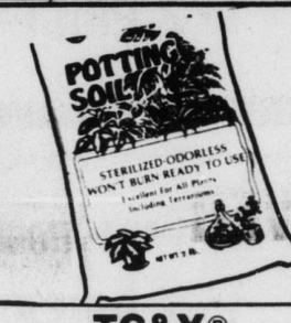
TG&Y® Potting Soil 7 lb. bag. Regular 1.19 value.