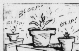
Indian lotus seeds have been known to germinate when they were almost 2,000 years of age.