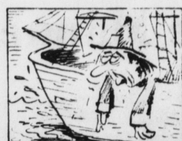
The pilgrims were on the "Mayflower" for 55 days before landing in America.

★Buying ★Selling ★Building MEMBER: Cleveland County Board of Realtors, Inc. and National Association of Realtors.