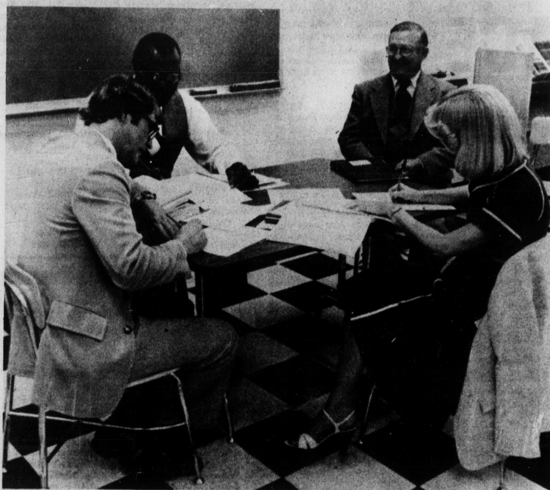
EVALUATION TEAM —Four members of a 15-member Southern Association of Schools and Colleges Evaluation committee are pictured tabulating scores and reports following a visit to KM Junior High Monday night and Tuesday. The team visit follows an 18-month evaluation and self-study