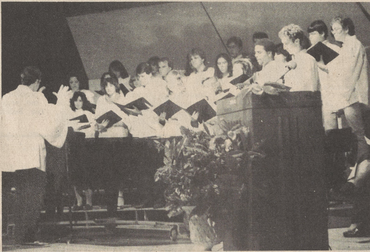
Erskine Choraleers perform here Sunday...