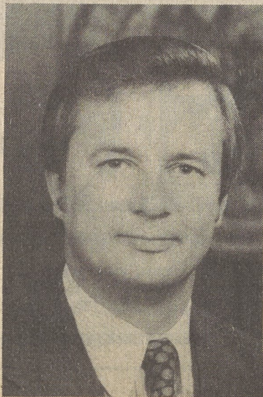
GOVERNOR JAMES B. HUNT

Open house and tours for the families of Sulzer employees and the general public will be held Saturday.