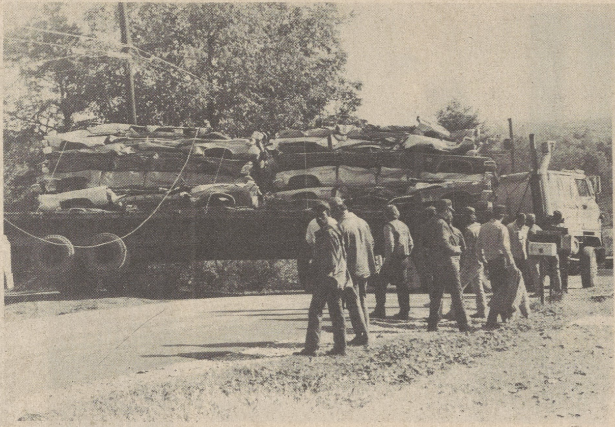
TUESDAY MORNING WRECK - A number of area residents keep a close eye on this 18-wheeler which cut too short while making a turn onto Center Street Tuesday and tipped over on its side. The truck, carrying 12 junked

Kings Mountain firemen extinguished a fire at 8:25 p.m. Tuesday at Parkdale Mills. A wander caught fire, causing extensive damage.