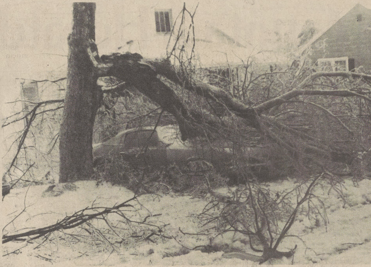
Fallen tree limb smashes car...