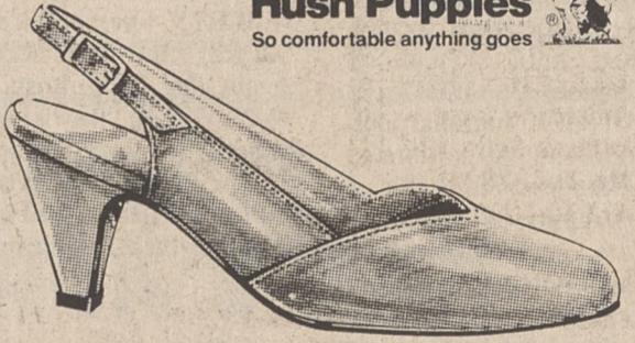
Tempo tailored sling with a crisp side accent. Navy or white. $30 00

Hush Puppies® So comfortable anything goes