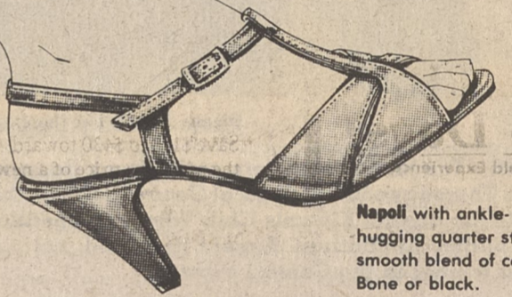
Napoli with ankle-hugging quarter strap and smooth blend of color. Bone or black. $30 00

Hush Puppies® So comfortable anything goes