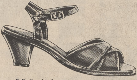
Kathy fine detail featuring tucks and medium heel. Black or white. $30 00

Hush Puppies® So comfortable anything goes