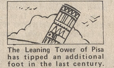
The Leaning Tower of Pisa has tipped an additional foot in the last century.