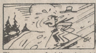
The sport of skiing is said to have begun in Telemark, Norway about 1860.

The third of 10 weekly contests is inside today's paper. Pick the most winners and you will pocket the next $100 check. Bring us your entry by 5 p.m. Friday, or mail it to Herald Football Contest, P.O. Box 752, Kings Mountain, N.C. 28086.