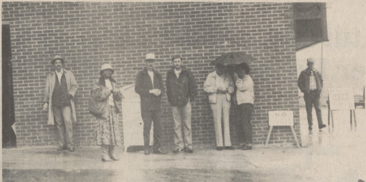
RAINY ELECTION - Supporters of candidates for Kings Mountain political offices huddle close to the community center building to escape the rainy weather Tuesday morning. Only 92 persons had voted at mid-morning when this photo was snapped, but the action picked up as the day went on.