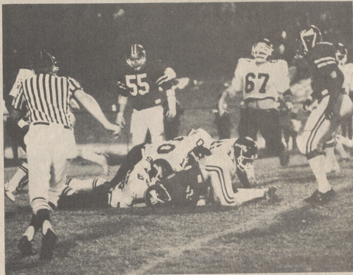
GOING AFTER FUMBLE - Kings Mountain and North Gaston players go after a Wildcat fumble in Friday's Southwestern 3-A Conference game at North Gaston. The Mountaineers recovered four fumbles and intercepted a pass as the defense led the team to its fourth win in six outings, 27-0.