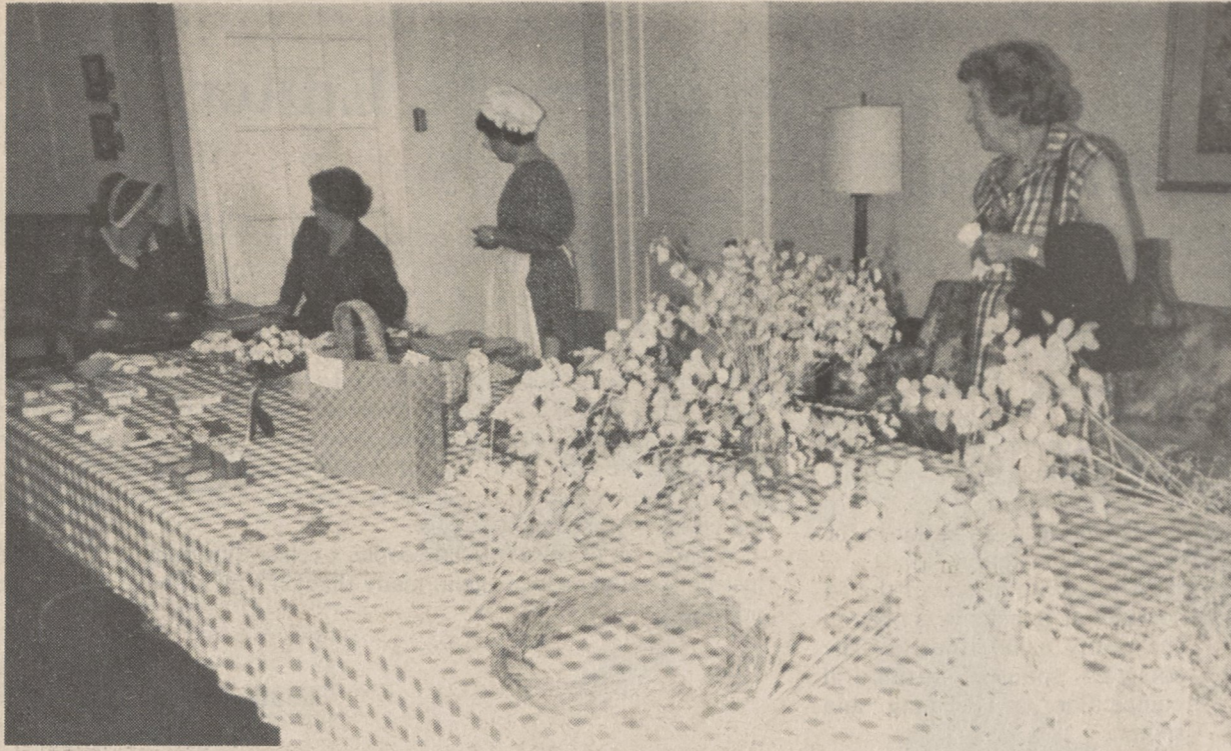
THE KINGS MOUNTAIN WOMAN'S CLUB...held their annual community festival, "Serenade to Autumn," to raise funds for civic projects and club maintenance on October 19. The festival had exhibits by local garden clubs, students and club members. Proceeds will be used toward a scholarship fund to be awarded to a local student who will later represent the club in a district contest for the Sally Southall Cotton Scholarship at UNC-G.