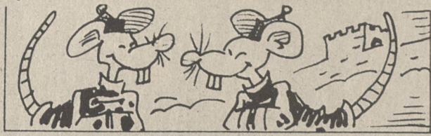
Scientists think that the house mouse originated in Asia.

One of Kings Mountain's 14-16 year old teams will play Shelby Friday and three local teams will play in Concord Saturday.