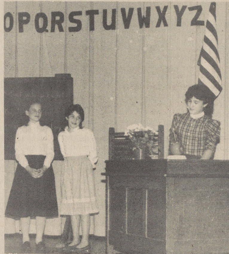
Students Give History