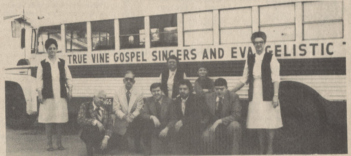
TRUE VINE GOSPEL SINGERS AND EVANGELISTIC TEAM - Pictured are members of the True Vine Gospel Singers and Evangelistic Team who will sing for a benefit Saturday night at the old Gastonia Armory. All proceeds will go to the mentally retarded

There is no admission charge and refreshments will be served. A love offering will be taken. The public is invited to attend.