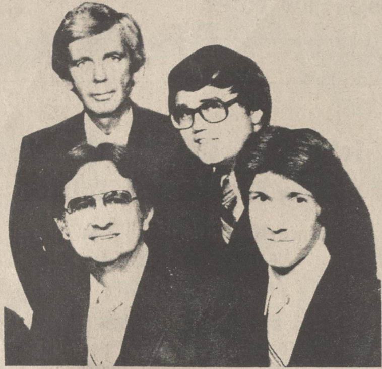
SINGING TOWERS —The Singing Towers, above, will perform on Sunday morning at the 11 o'clock service at East Gold Street Wesleyan Church. They will present "A Ministry Through Music" and the community is invited to attend.