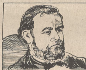
Ulysses S. Grant, an unknown ex-soldier at the beginning of the Civil War, became the first of the nation's generals to wear four stars.