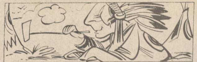
The Dakotas were named for the Sioux Indians who once roamed the territory. The Sioux called themselves Dakota, meaning allies or friends.