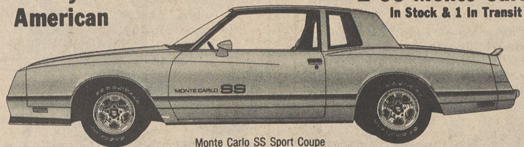
Monte Carlo SS Sport Coupe

2 SS Monte Carlo's In Stock & 1 In Transit