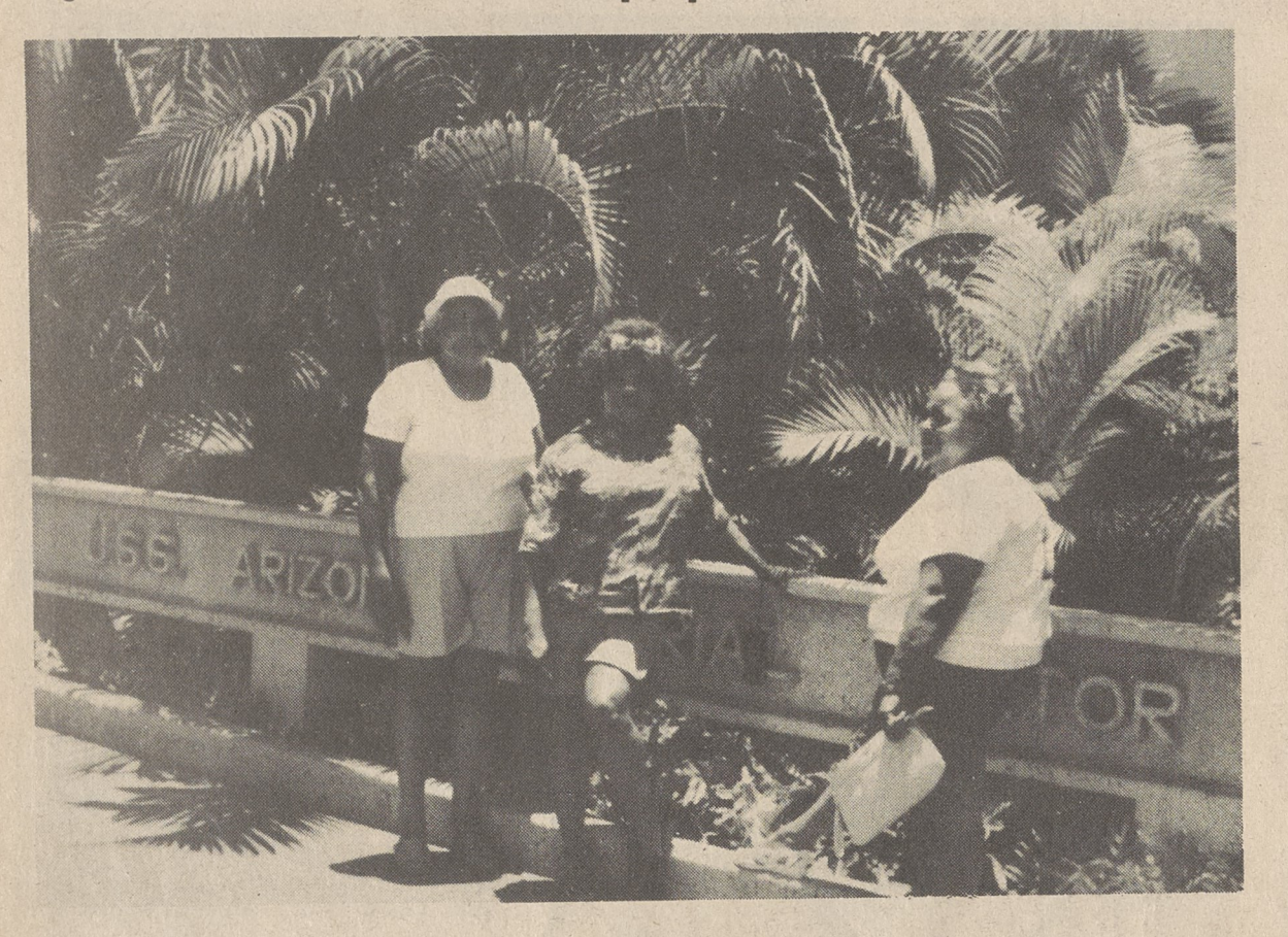
Page 4A-KINGS MOUNTAIN HERALD-Thursday, July 26, 1984