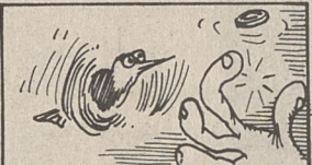
The average hummingbird weighs less than a penny.