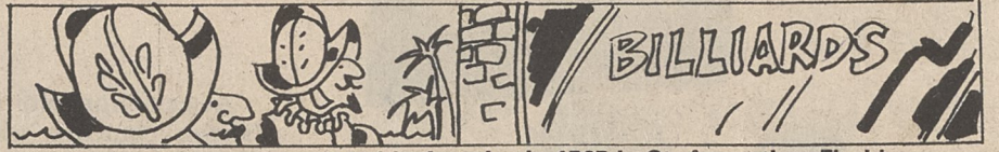
Billiards were first played in America in 1565 in St. Augustine, Florida.

909 GROVER ROAD KINGS MOUNTAIN, N.C. 28086 PHONE 739-5656