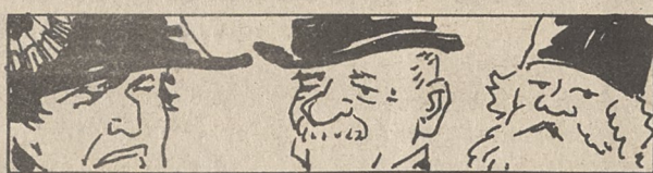
Napoleon Bonaparte, banker J.P. Morgan and novelist Leo Tolstoy were all avid solitaire players.