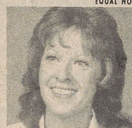
JANE COCHRAN 739-4613

NEW LISTING: 2 story brick/wood contemporary home. 3 bedrooms, 2 1/2 baths, formal living & dining rooms, spacious den with fireplace & insert. Beautifully decorated with wall cover & chair rail effect. Wooden deck, large lot, White Plains area. Only $73,000.