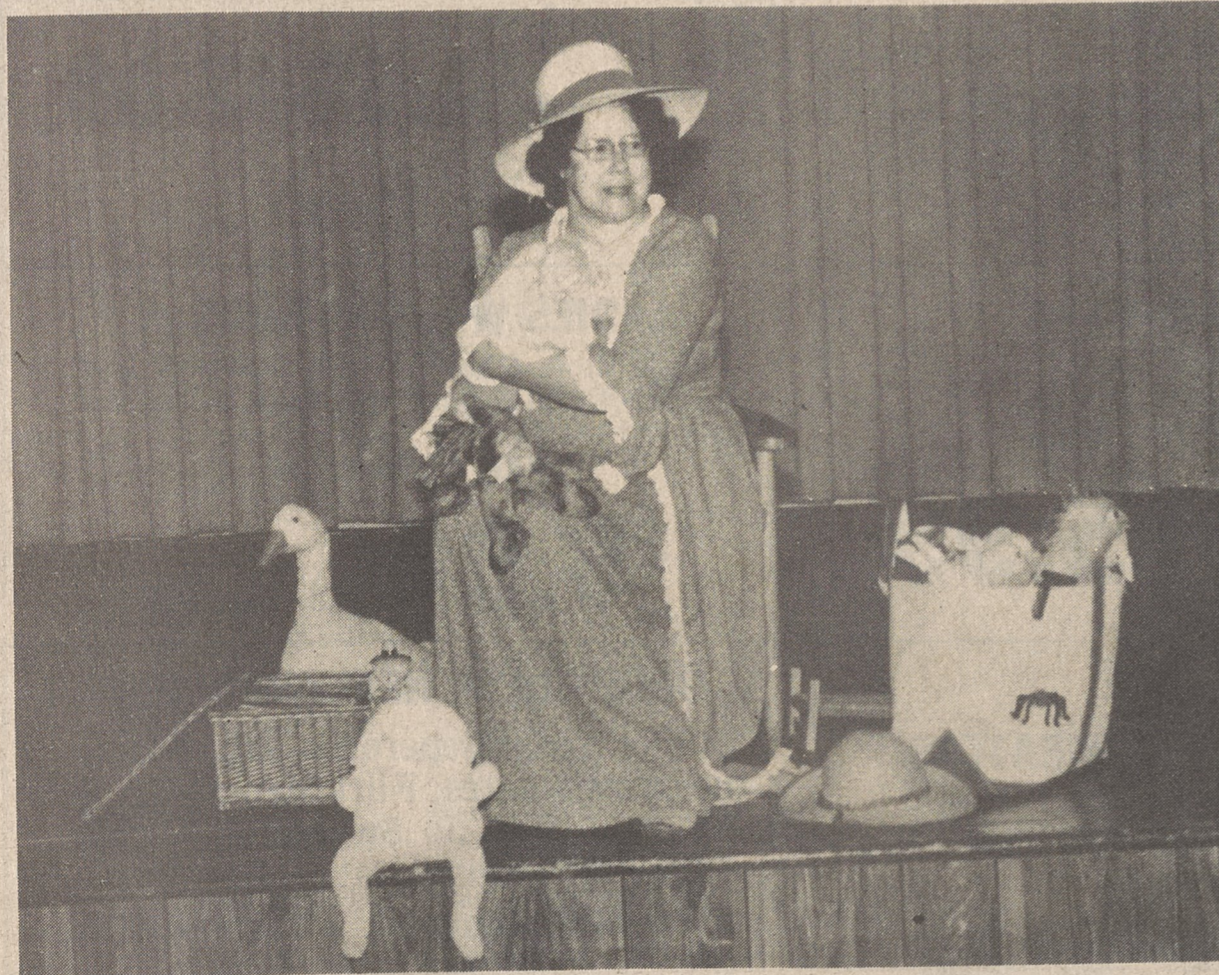
MOTHER GOOSE ....Visits KM Schools