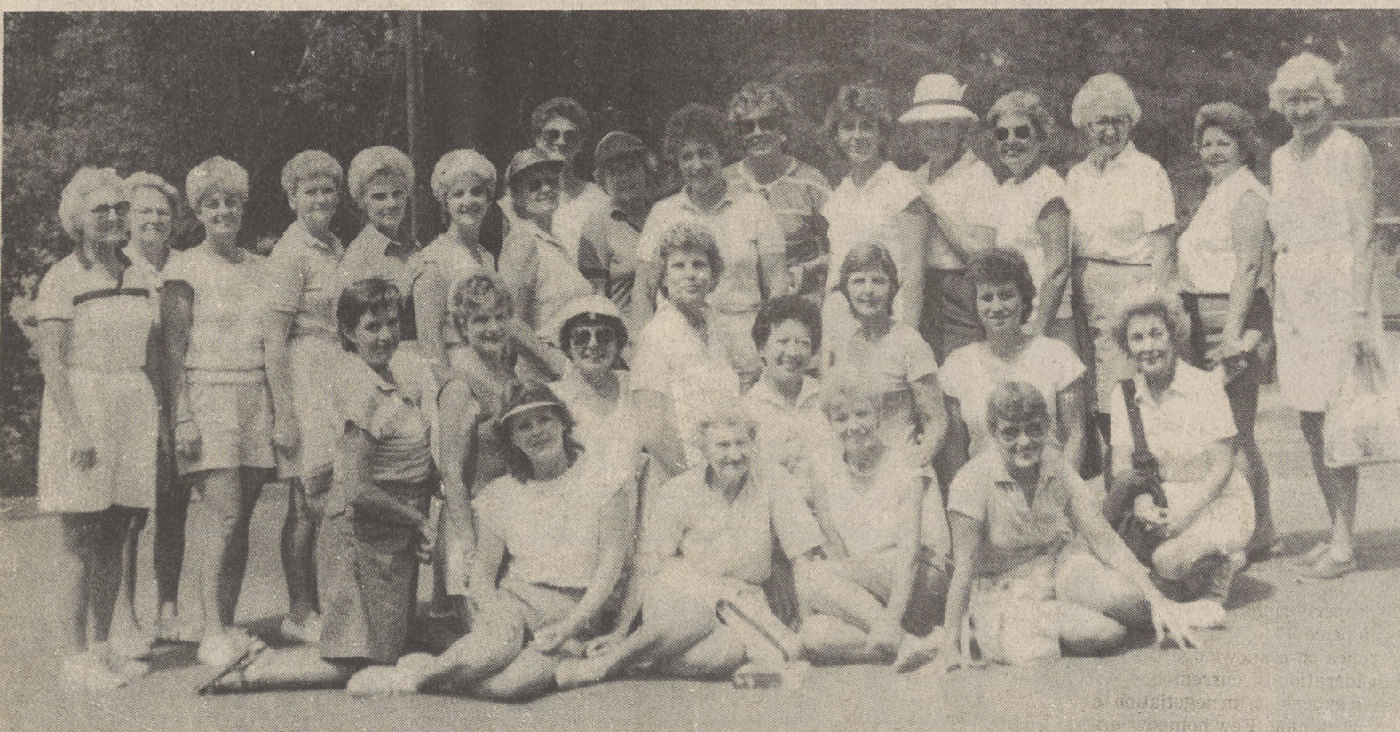
FOOTHILLS GOLFERS—Pictured are members of the Foothills League of Women Golfers who came to Kings Mountain last week to play in a tournament at KM Country Club. Ten clubs were represented and