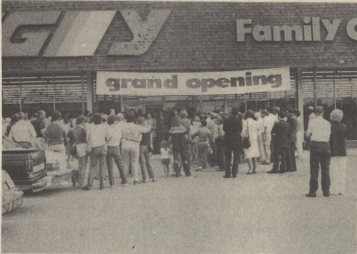
BIG TURNOUT AT TG&Y - A large crowd gathers outside of TG&Y in the West Gate Plaza Thursday morning to await the store's grand opening. TG&Y officials decided to re-open the store after much encouragement by Kings Mountain citizens and a re-evaluation of the market potential in this area.