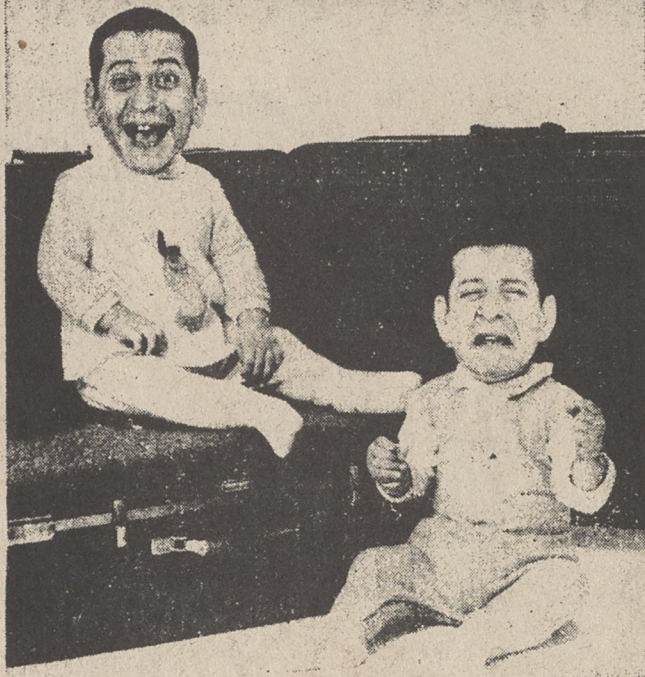
THE FEARLESS TWINS