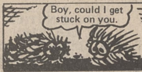
A mature porcupine has over 30,000 quills.