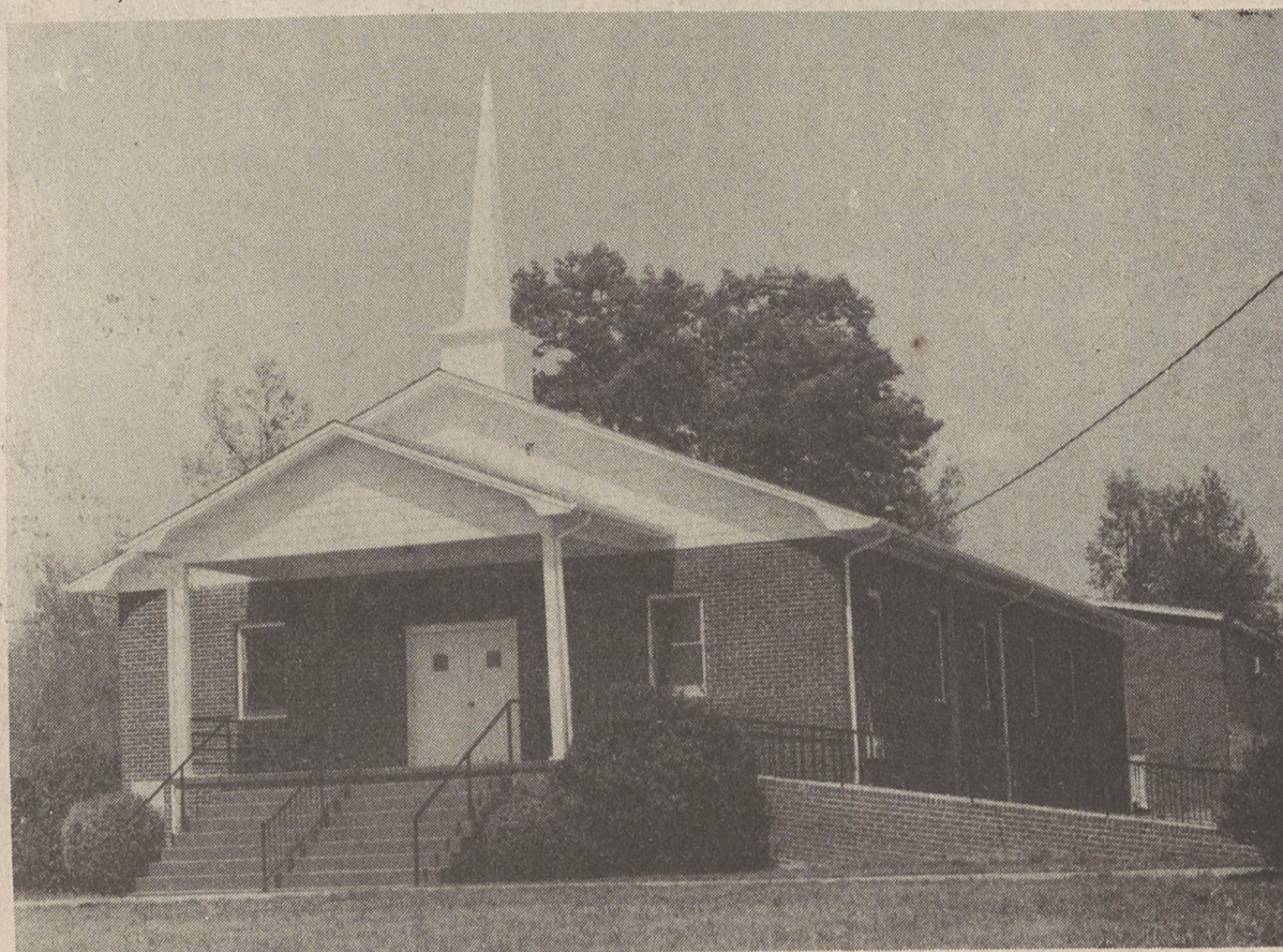
LONG BRANCH CHURCH TO NOTE ANNIVERSARY—Long Branch Baptist Church of Grover will celebrate its 122nd anniversary in special services Sept. 15th.