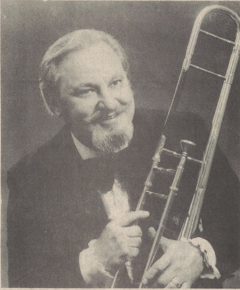
BUDDY MORROW....Conducts Orchestra