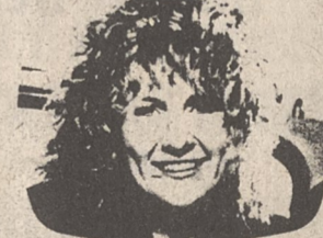
LACY J. DALTON