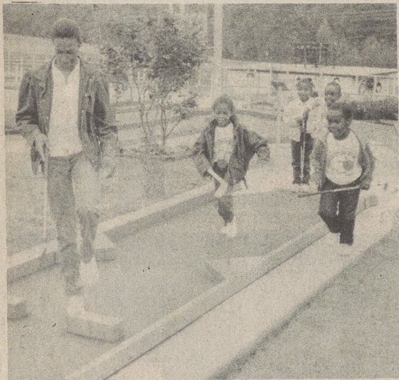
ENJOY PUTT PUTT - Head Start children from the Kings Mountain School District are pictured above playing putt putt Wednesday in Shelby. The Head Start program is observing its 28th anniversary in Kings Mountain during the month of October.