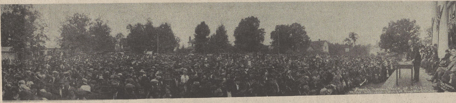
Over 20,000 Attended 1920 Celebration...