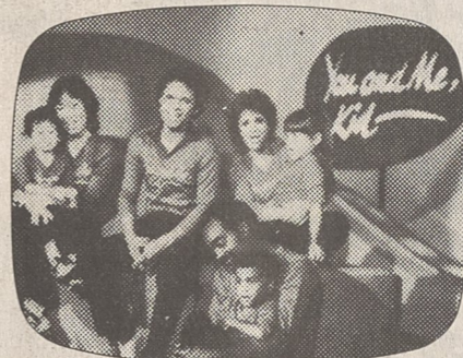
YOU AND ME, KID