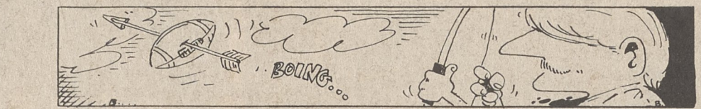
In 1457, the Scottish Parliament outlawed football and golf because it felt that the two sports had lured young Scots from the more soldierly exercise of archery.